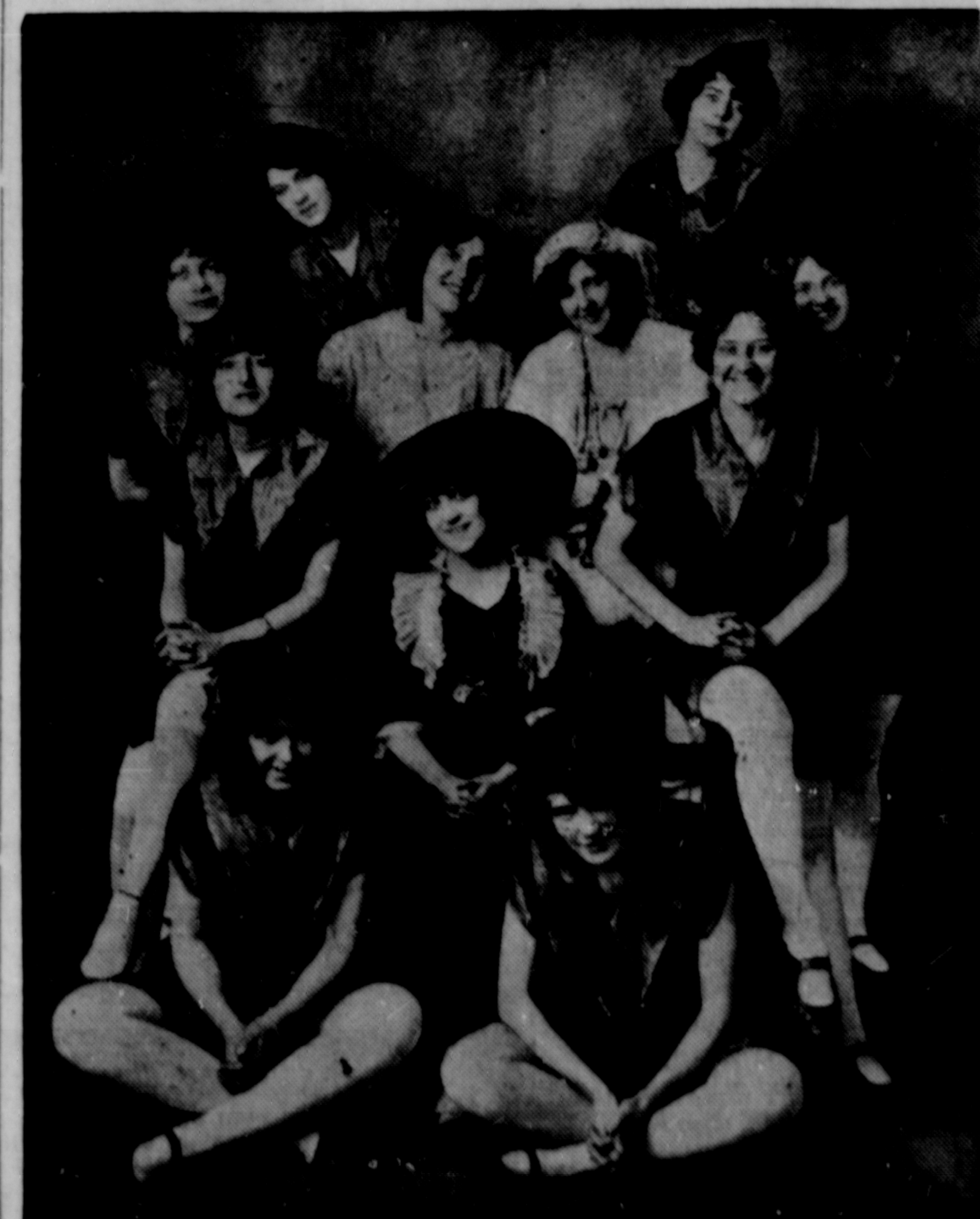
WITH THE FRANK RICH CO. AT THE WESTHOLME THEATRE