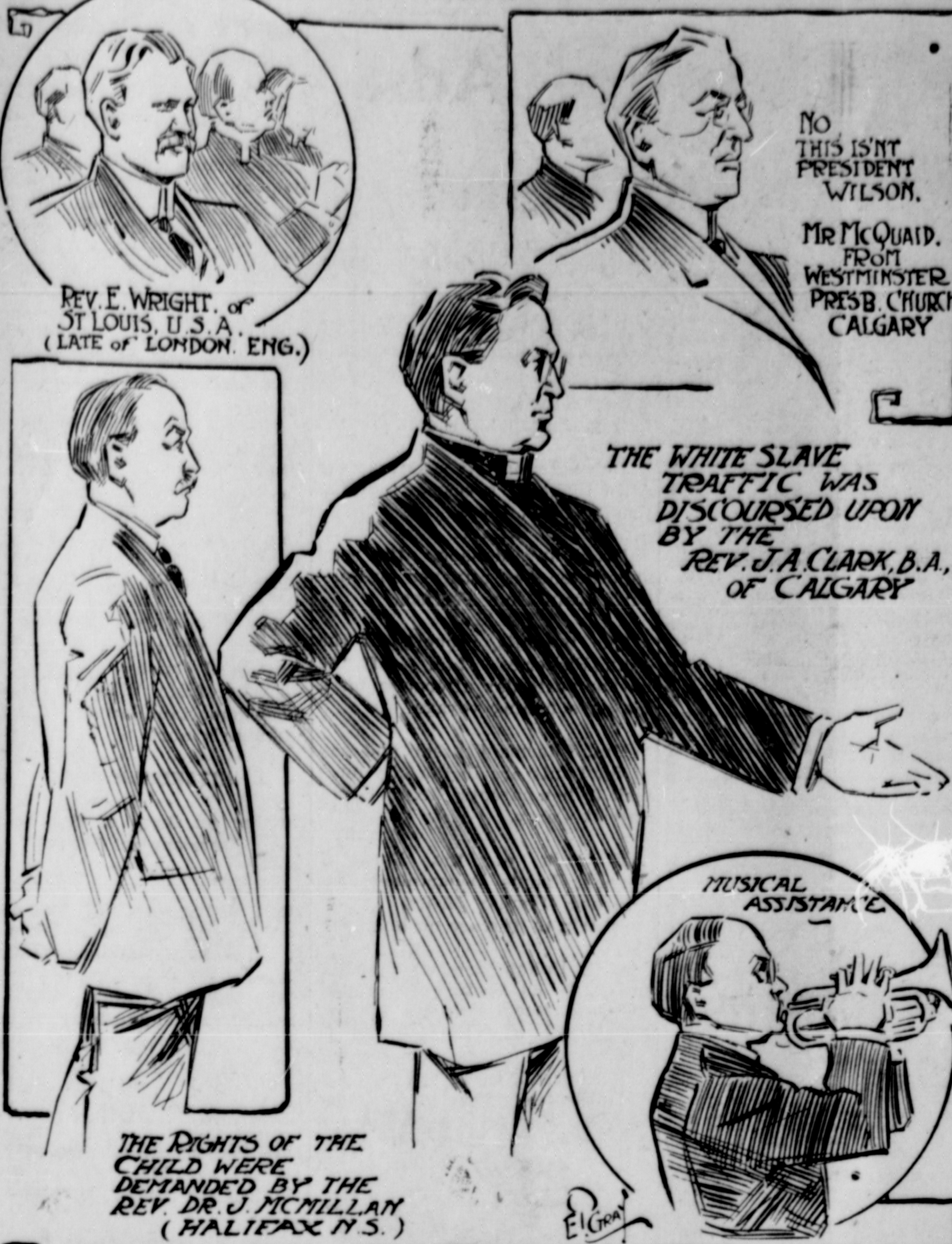
SOME STRIKING FIGURES AT THE PRESBYTERIAN GENERAL ASSEMBLY AT TORONTO.

For a License to Take and Use Water. Notice is hereby given that The Prince Rupert Hydro-Electric Company, Limited, of Prince Rupert, B. C., will apply for a license to take and use 50 cubic feet per second of water out of Madeline Creek, which flows in an easterly direction through Crown lands, and empties into mouth of the Skeena River about 13 miles from its mouth on the south bank. The water will be diverted at unnamed falls about one mile from mouth of creek, and will be used for generating electric power purposes for sale, barter or exchange within a radius of 100 miles. This notice was posted on the ground on the 16th day of May, 1913. The application will be filed in the office of the Water Recorder at Prince Rupert, B. C. Objections may be filed with the said Water Recorder or with the Comptroller of Water Rights, Parliament Buildings, Victoria, B. C. PRINCE RUPERT HYDRO-ELECTRIC CO., LTD. By Geo. H. Kohl, Agent. Pub. May 26, 1913—June 16, 1913.