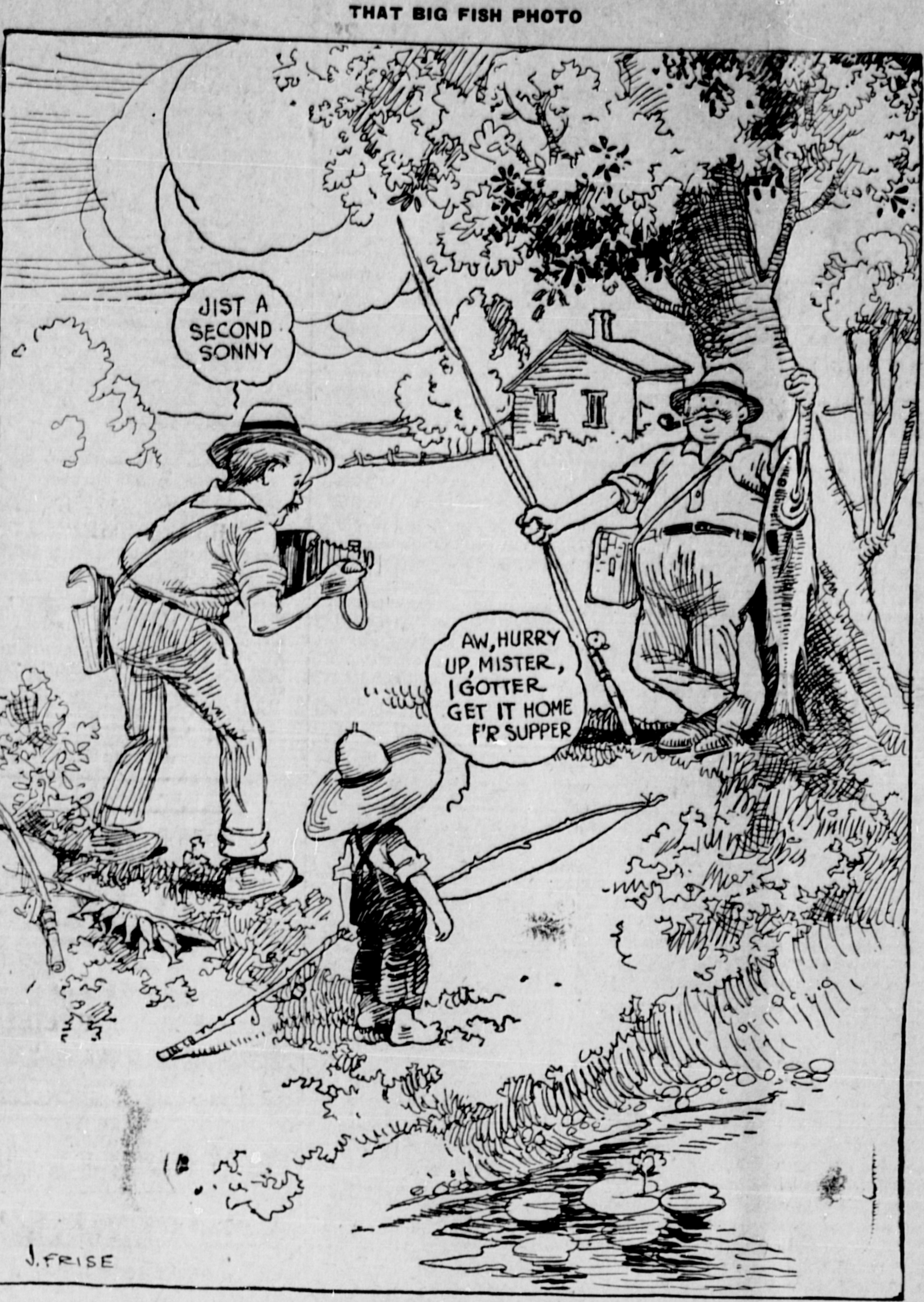
BORROWED FOR THE OCCASION

Take notice that the PORT EDWARD TOWNSITE COMPANY, LIMITED, of Prince Rupert, in the Province of British Columbia, will apply to the Minister of Lands for approval of the plans of the works to be constructed for the utilization of the water from Wolf Creek, Skeena District, for which application has been made by the company, and has been issued by the Comptroller of Water Rights, granting permission to the company to construct the works for the utilization of the water from Wolf Creek for Municipal Purposes.