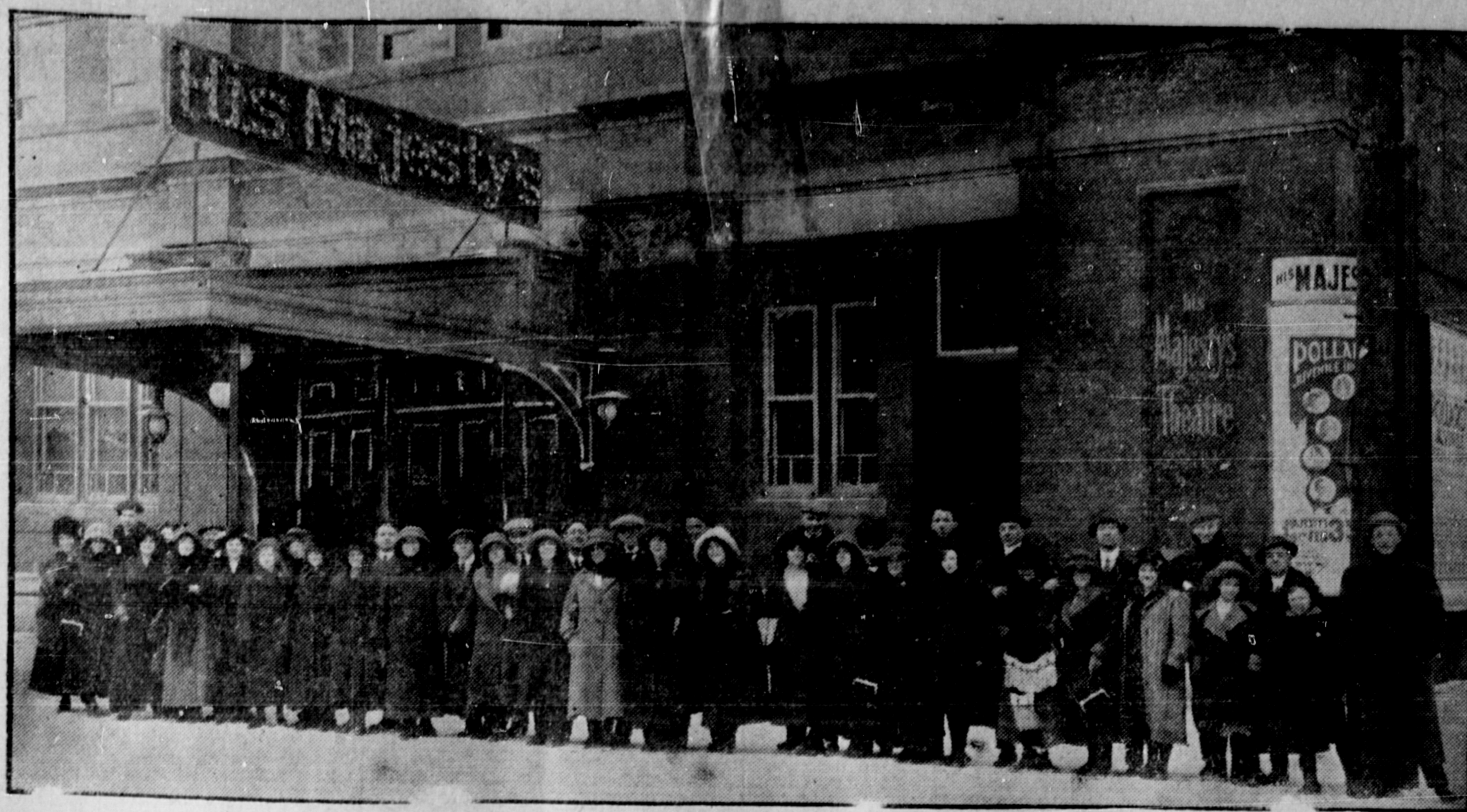
THE POLLARD OPERA COMPANY IN FRONT OF HIS MAJESTY'S THEATRE, MONTREAL. WILL APPEAR AT THE WESTHOLME OPERA HOUSE SEPTEMBER 20TH TO 27TH.

Launch Alice B for hire. Telephone Green 394, Davis' Float. 155-11