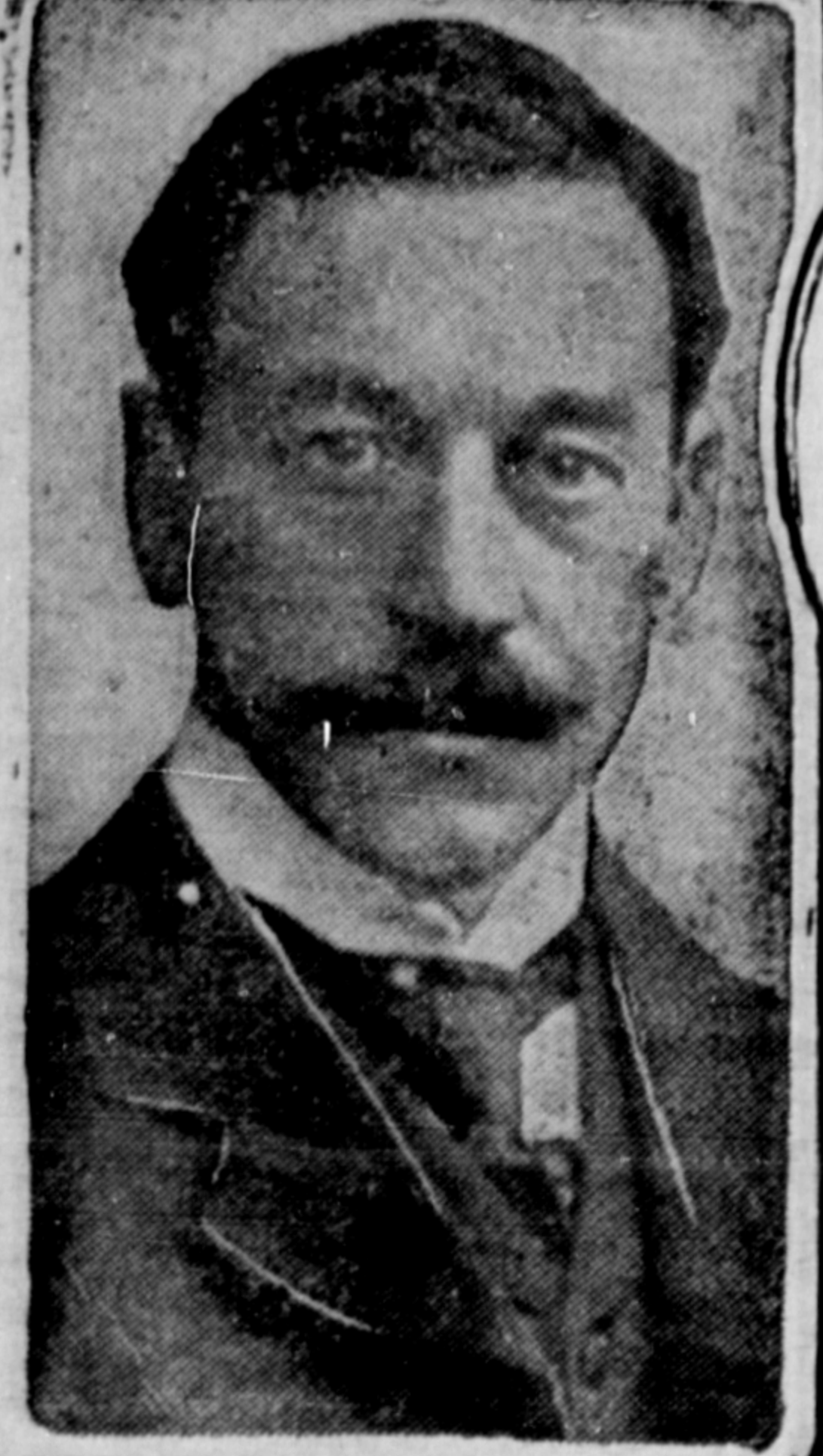
Rt. Hon. HERBERT SAMUEL, POSTMASTER GENERAL.

WATER NOTICE. Application for a license to take and use water will be made under the Water Act of British Columbia as follows: 1. The name of the applicant is B. C. Salt Works, Ltd., F. H. Mobley, agent. 2. The address of the applicant is Skeena, B. C. 3. The name of the stream is Kwinitsa River. The stream has its source in mountain range about 5 miles west of the Skeena River, flows in a southeasterly direction and empties into Skeena River about 1 mile south from Kwinitsa station. 4. The water is to be diverted from the stream on the south side, about 5,280 feet from mouth. 5. The purpose for which the water will be used is mining and manufacturing. The land on which the water is to be used is described as follows: Mineral claims owned by the B. C. Salt Works, Ltd., and located adjacent to Lot 74 and Lot 75, Skeena River. 6. The quantity of water applied for is as follows: Twelve hundred (1200) miners' inches. This notice was posted on the ground on the 6th day of September, 1913. A copy of this notice and an application pursuant thereto and to the requirements of the Water Act will be filed in the office of the Water Recorder at Prince Rupert, B. C. Objections may be filed with the said Water Recorder, or with the Comptroller of Water Rights, Parliament Buildings, Victoria, B. C., this 29th day of August, A. D. 1913. W-Sept. 1-22