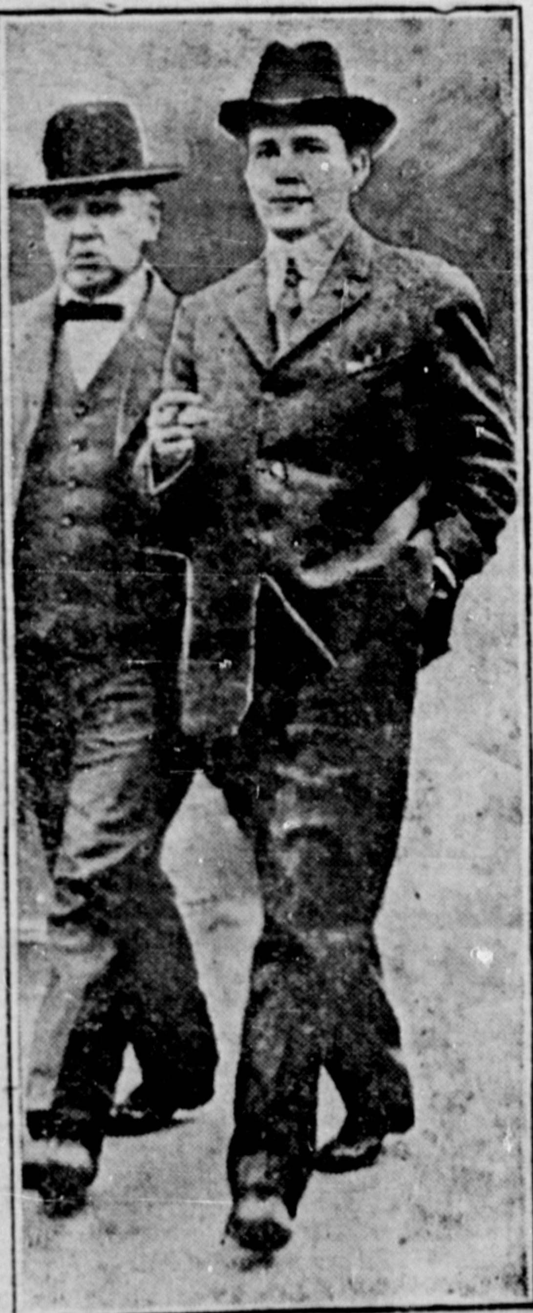
THAW AND HIS CAPTOR.

Thaw said today that a report had reached him from New York that William T. Jerome intended