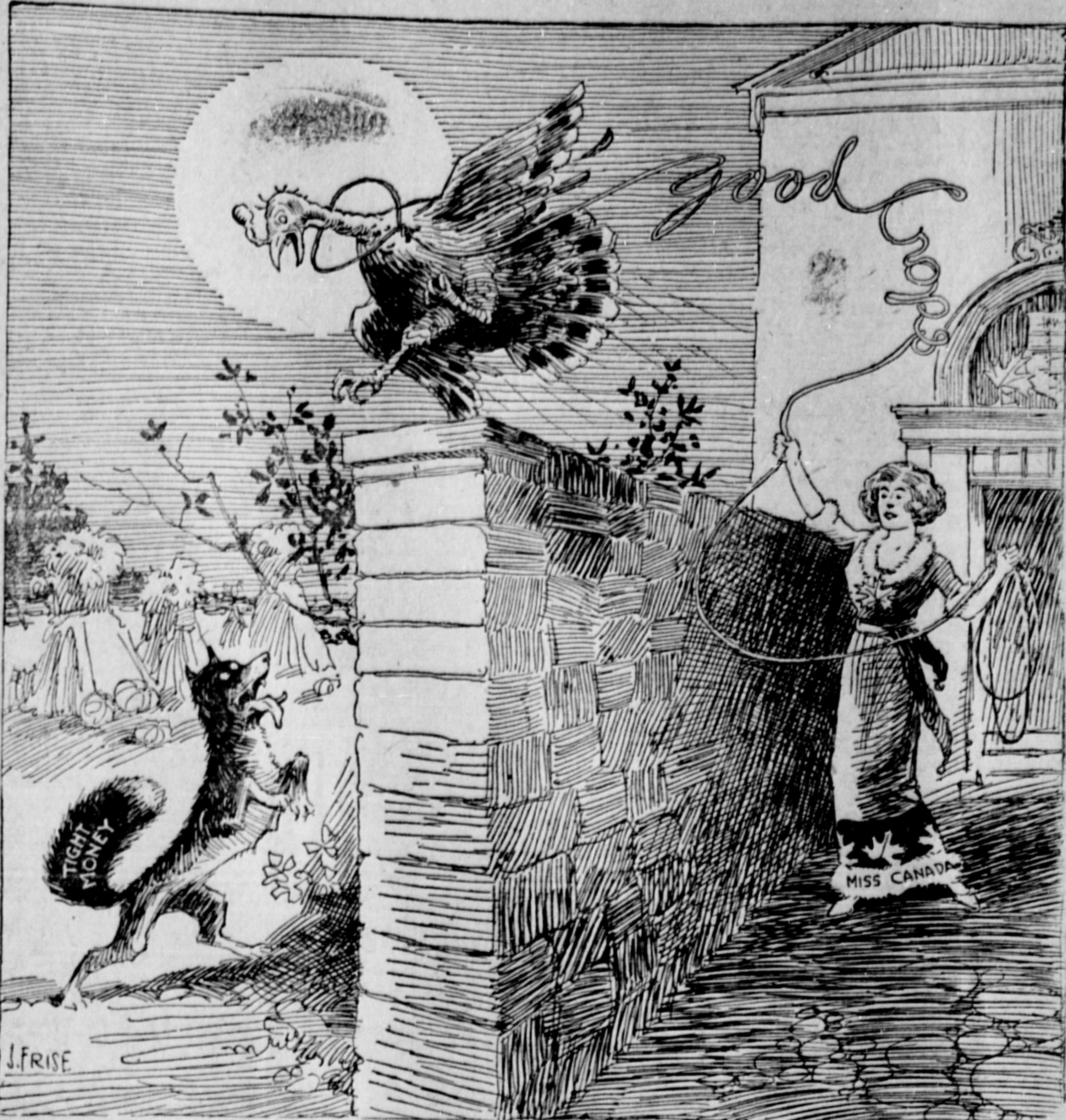
MISS CANADA CAPTURING THE WARY BIRD OF EUROPEAN FINANCE

The immense crops of the Canadian West, far surpassing those of previous years and also those of any other country per acreage, has opened the eyes of financial Europe to the potentialities of the Dominion and loosened its strings. During the past month many leading men have publicly commented on the prosperity of Canada and classed her commercial credit at A1. Money is much easier generally, and Miss Canada is catching her share of it for her varied enterprises and development undertakings.