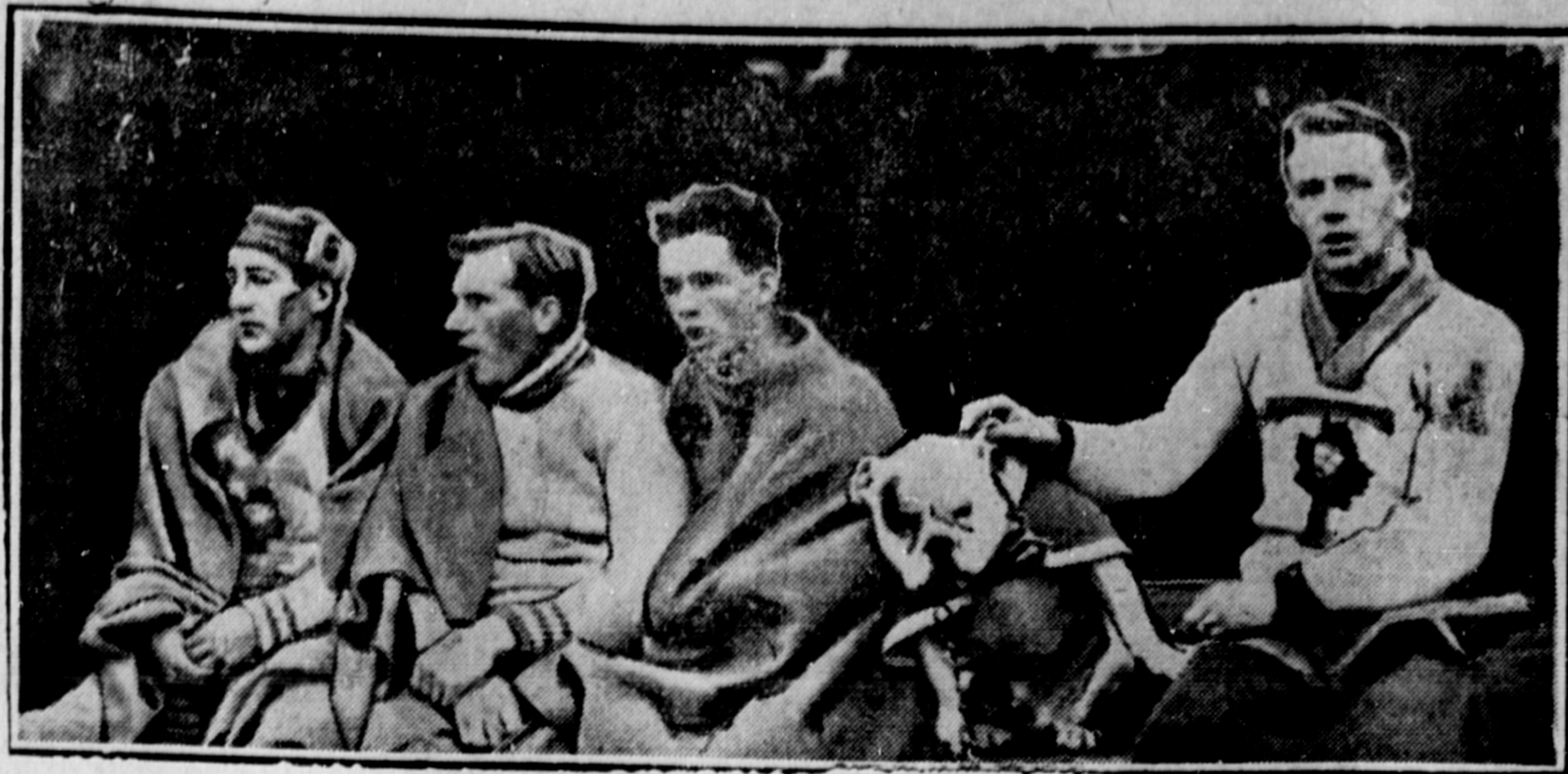
WINNING OF THE INTERCOLLEGIATE CHAMPIONSHIP BY MCGILL.