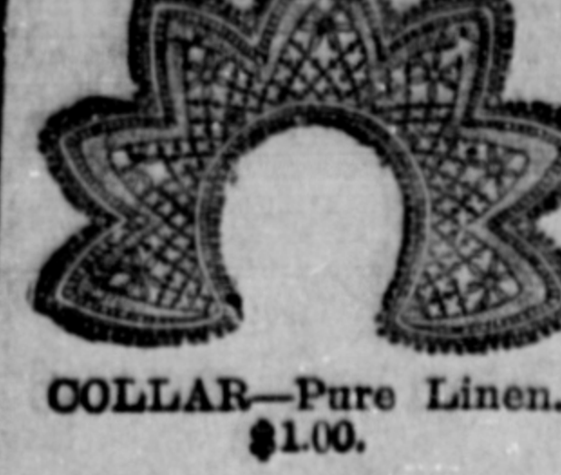
COLLAR—Pure Linen. $1.00.

Every sale, however small, is a support to the industry.