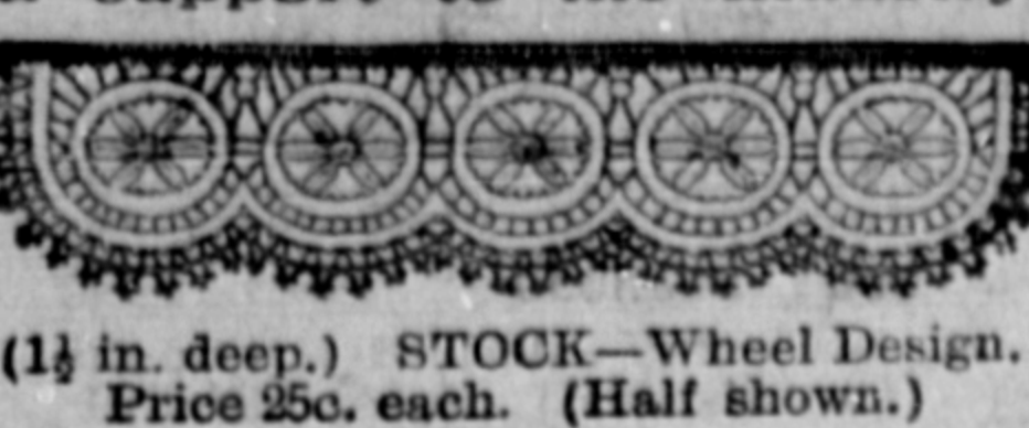
(1 1/2 in. deep.) STOCK—Wheel Design. Price 25c. each. (Half shown.)