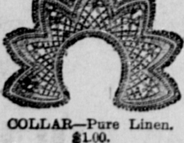
COLLAR—Pure Linen. $1.00.

Collars, Fronts, Plaques, Jabots, Yokes, Fichus, Berthes, Handkerchiefs, Stocks, Camisoles, Chemise Sets, Tea Cloths, Table Centres, D'Oyleys, Mats, Medallions, Quakers and Peter Pan Sets, etc., from 25c. 60c., $1.00, $1.50, $2.00 up to $5.00 each. Over 300 designs in yard lace and insertion from 10c. 15c., 25c., 40c., up to $3.00 per yard.