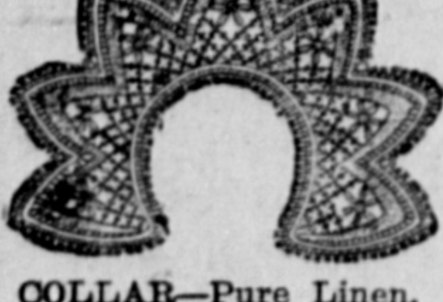
COLLAR—Pure Linen. $1.00.

Collars, Fronts, Plaques, Jabots, Yokes, Pichus, Berthes, Handkerchiefs, Stocks, Camisoles, Chemise Sets, Tea Cloths, Table Centres, D'Oylies, Mats, Medallions, Quaker and Peter Pan Sets, etc., from 25c. each, $1.00, $1.50, $2.00 up to $5.00 each. Over 300 designs in yard lace and insertion from 10c. to 25c. 45c., up to $3.00 per yard.