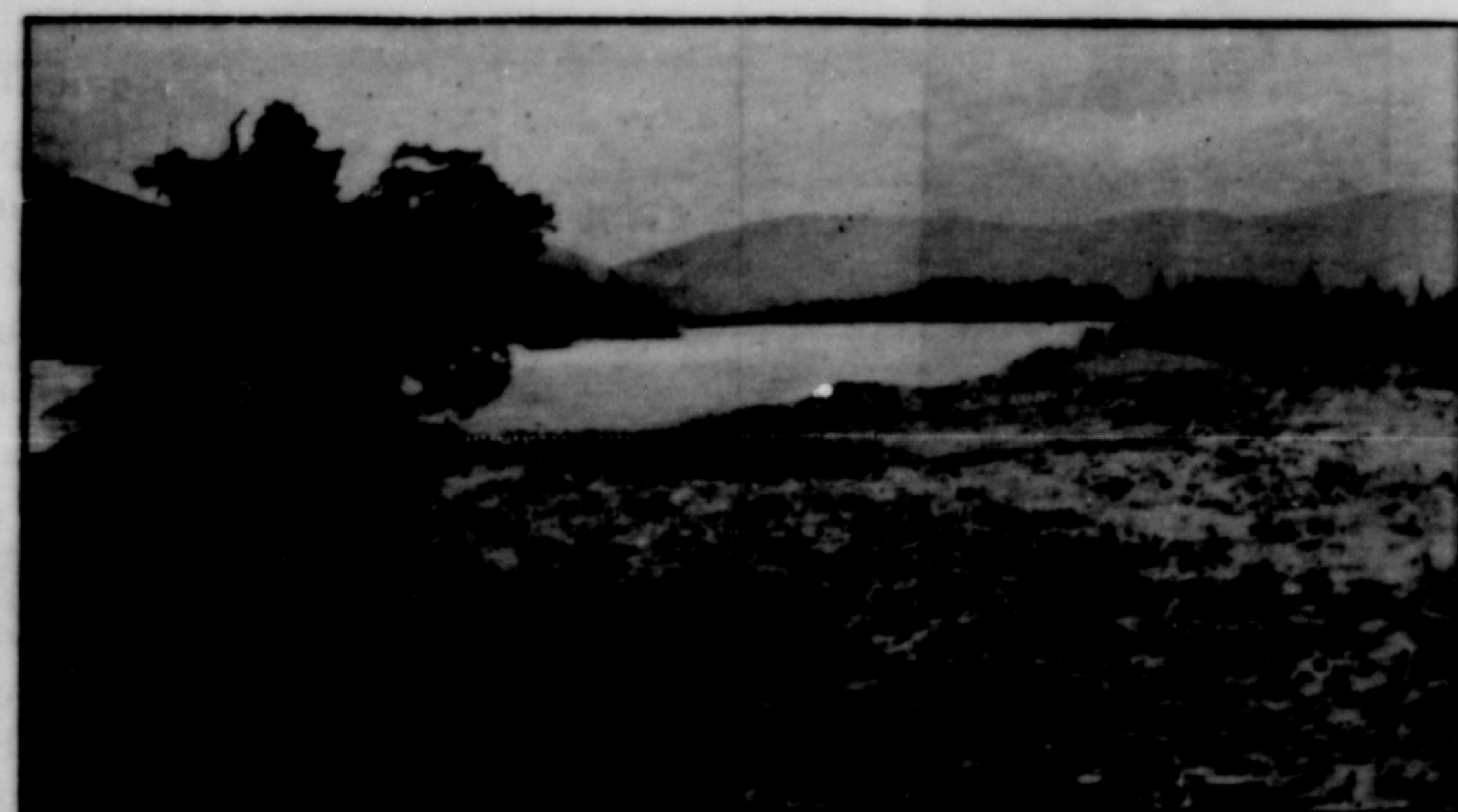
VIEW OF UPPER END OF THE HARBOR

Prince Rupert's future as one of the wealthiest cities in all Canada is assured. It is the chosen terminus of the great National Transcontinental Railway, finest on the whole continent. It is the nearest port to Alaska and the nearest port to the Orient. It is the natural supply centre for hundreds of miles. The wealth of Prince Rupert's tributary resources by sea and by land is untold. Prince Rupert is marked out by man and by nature for magnificent prosperity.