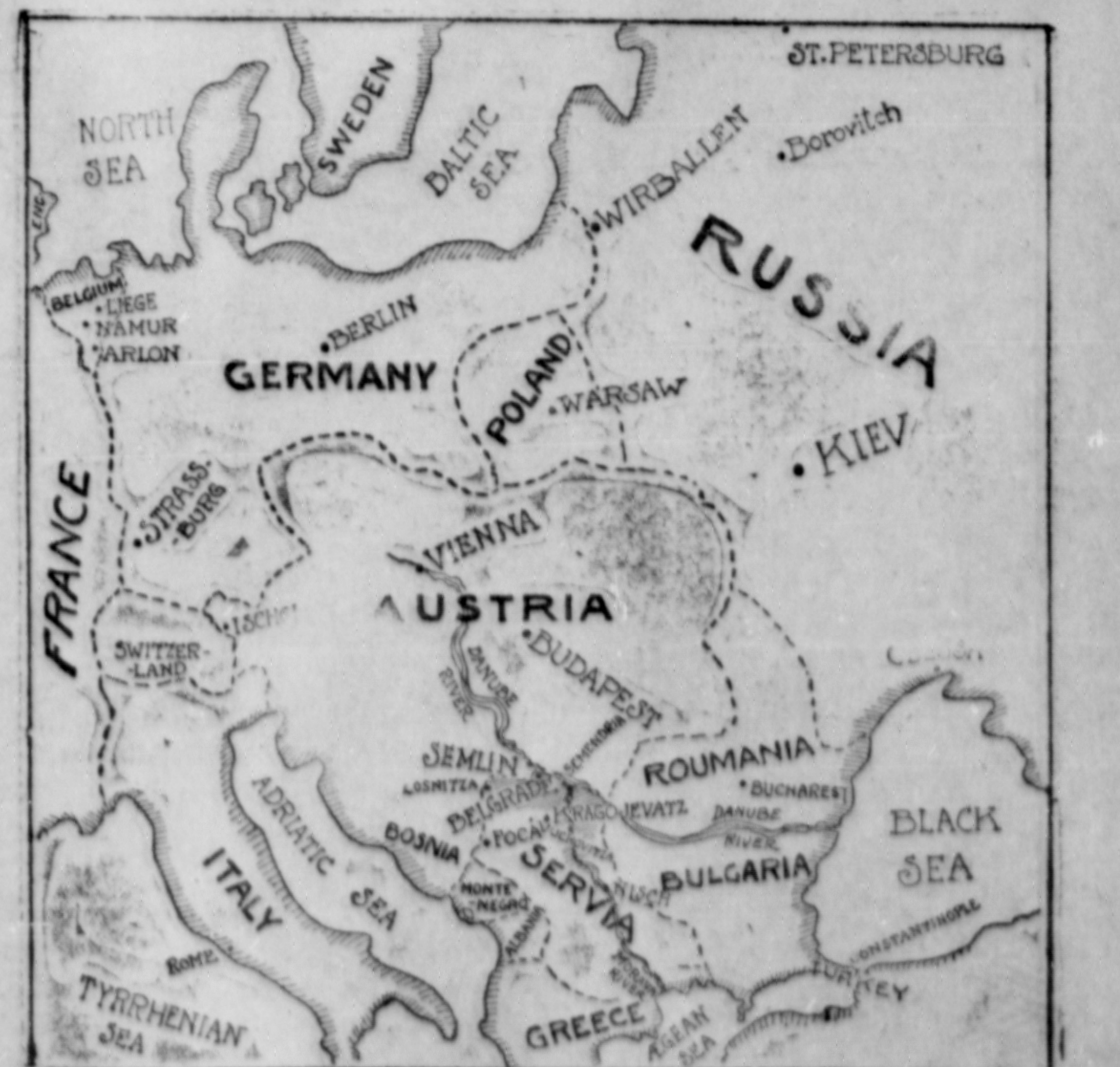
Position of opposing armies of Austria and Serbia. Map of Serbia showing where engagements have already taken place and where the Serbians are holding the Austrians back at Morava Pass. The Serbians now propose entering Bosnia.

Some people don't want to lend you anything but trouble.