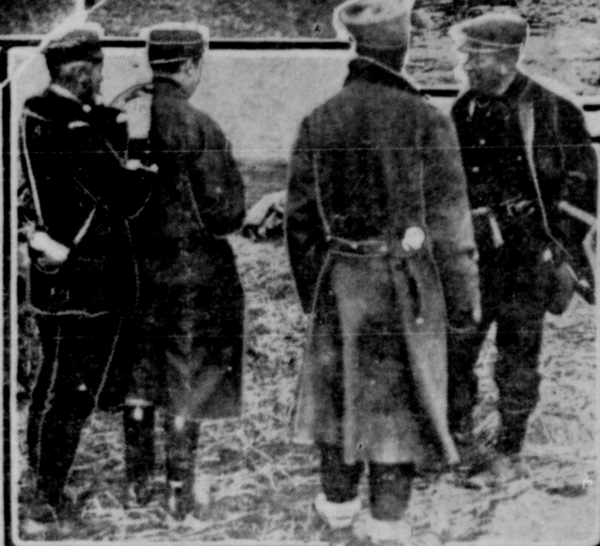
NEAR PERVYVE COMMANDANT FICHEL FRENCH MARINES WRITING DISPATCH TO HEADQUARTERS.

Ladies' woolen combinations for $1.75 at Jabour Bros.' Sale.