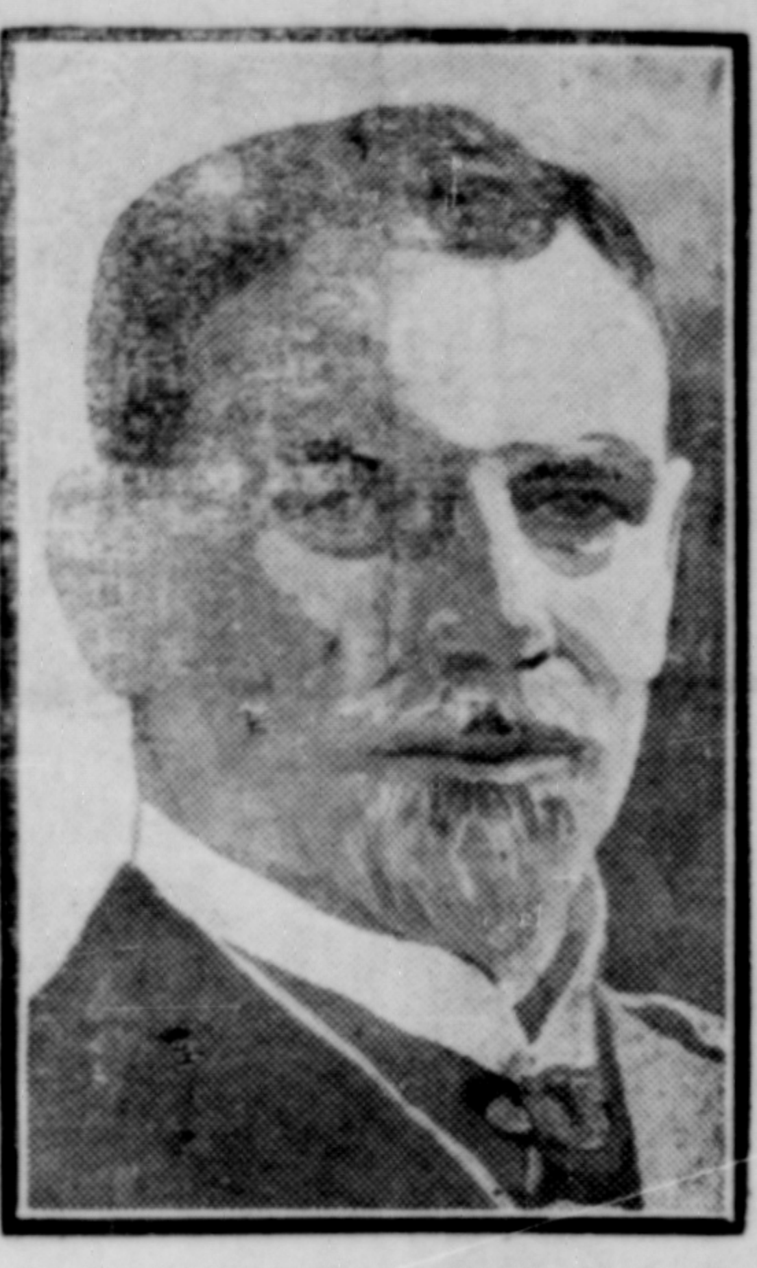
ADMIRAL VON SPEE — Commander of the German squadron, who met the same fate meted out by them to Admiral Craddock off the Chilean Coast recently.

United States President Announces He Will Send Warships to Panama. Washington, Dec. 15.—President Wilson and his cabinet decided today to send warships to the canal zone to guard against violations of neutrality there by belligerent ships.