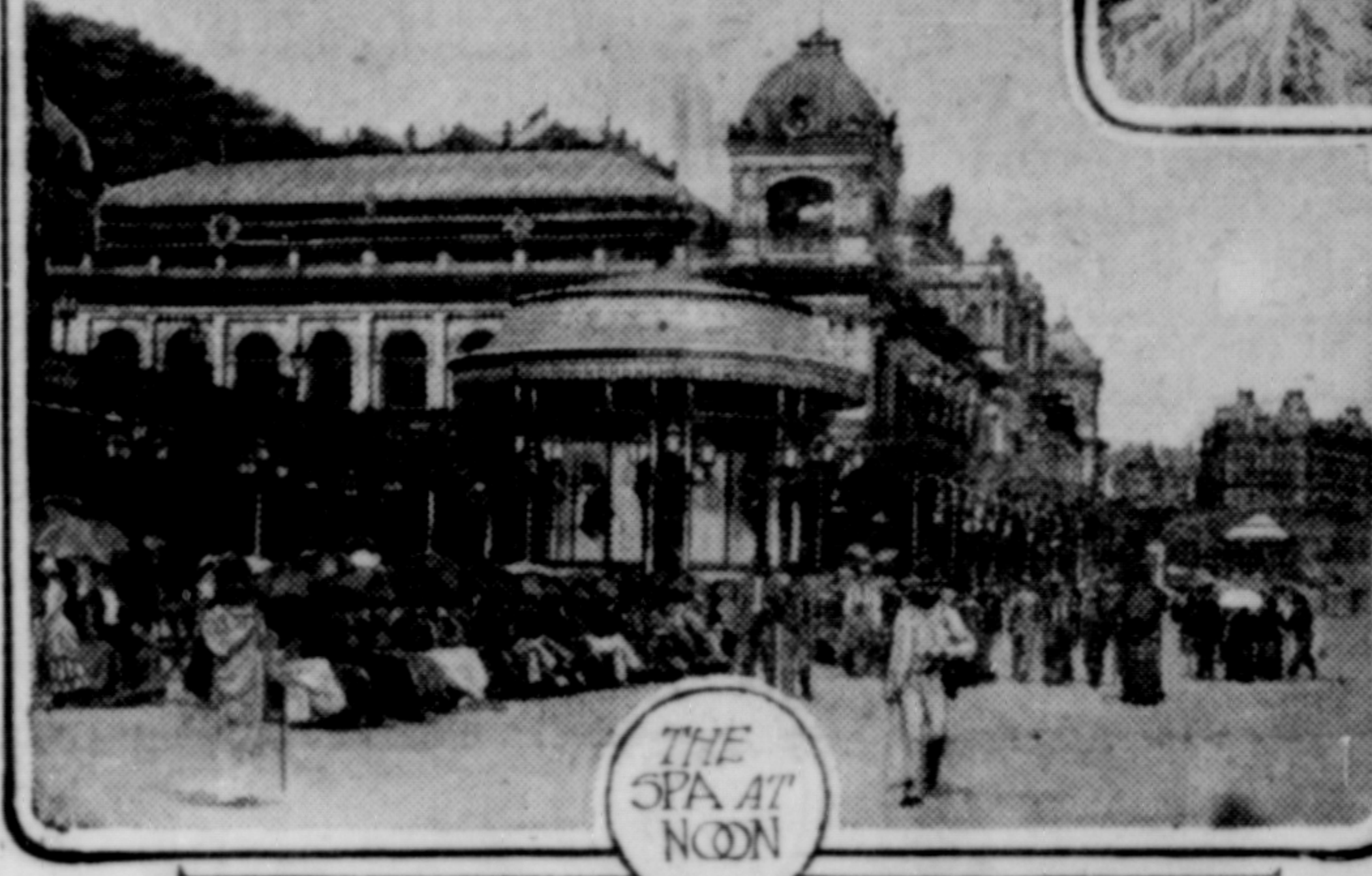
Englands famous east coast watering place and its two big points of interest.