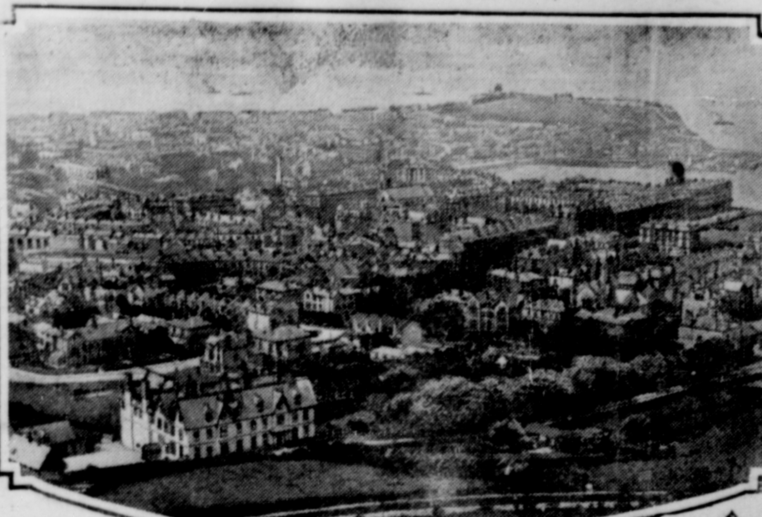
SCARBOROUGH FROM OLIVER'S MOUNT