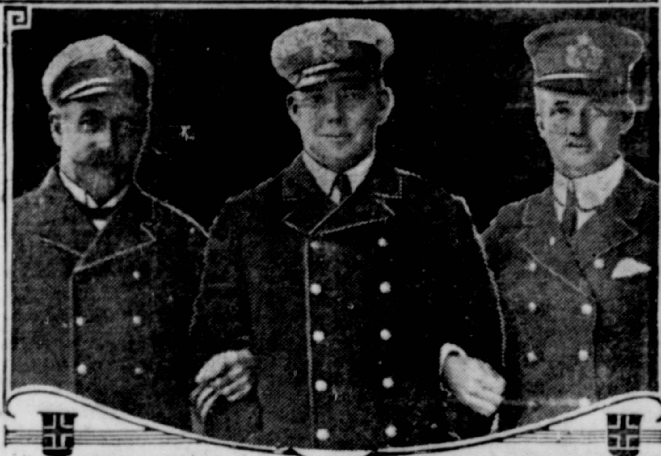
U. S. SCHOONER WM. P. FRYE; GERMAN AUXILIARY CRUISER PRINZ EITEL FRIEDRICH AND HER OFFICERS.

They look as smart and are as well cut as the $40 kind—the $15 blue serge suits at Wallace's. tf.