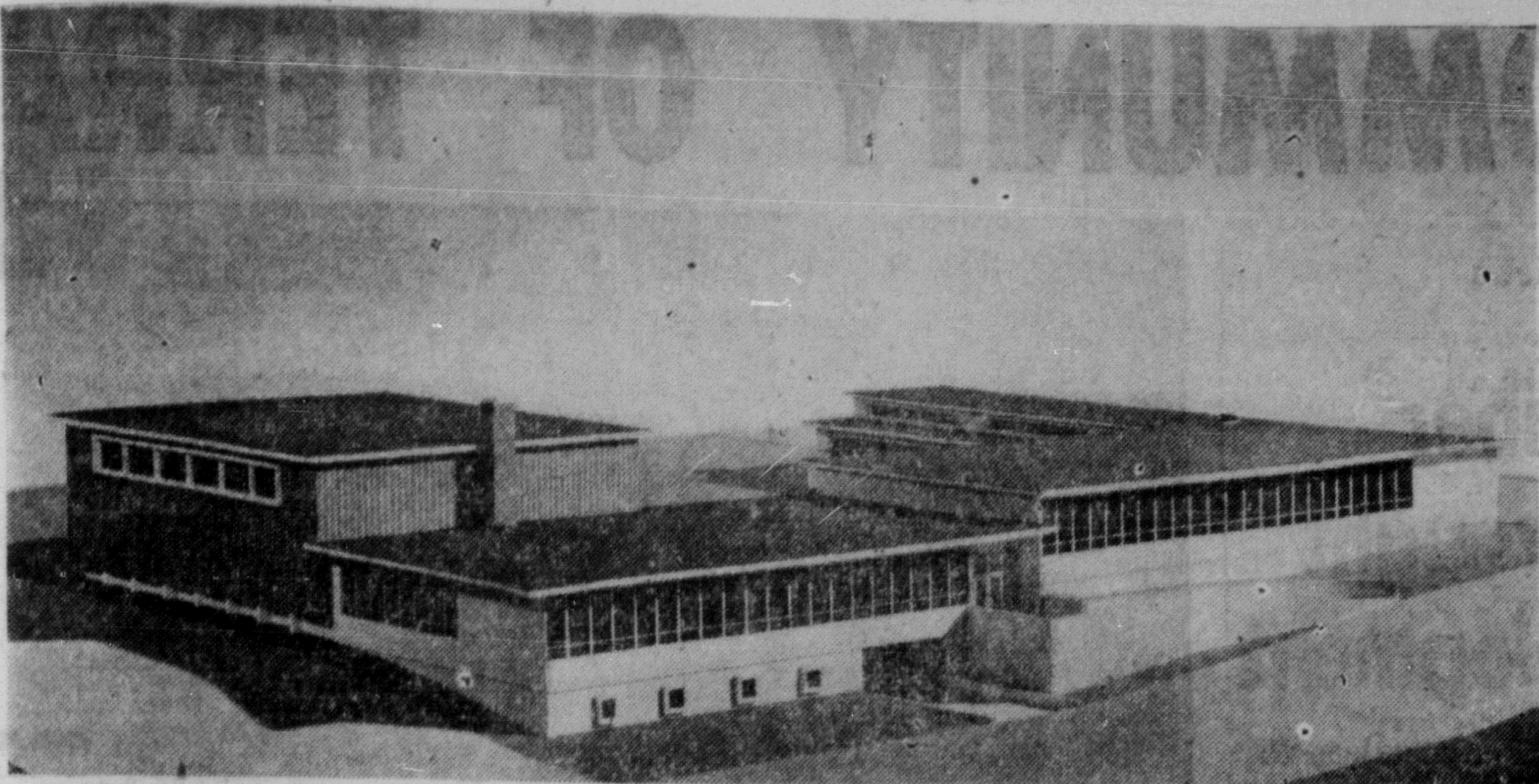
KING EDWARD—New Elementary School.