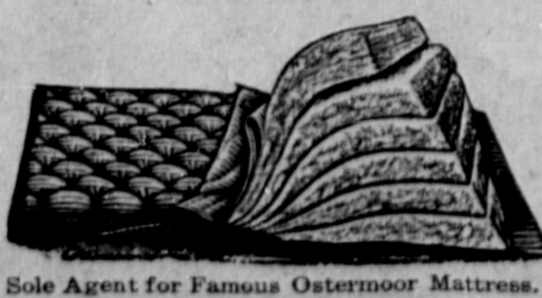
Sole Agent for Famous Ostermoor Mattress.