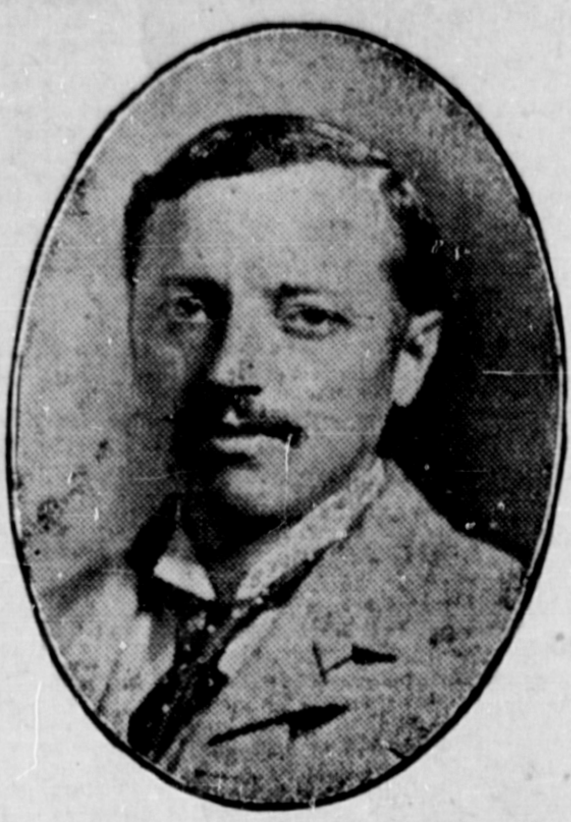
SIR THOS. McNAMARA, M. P. Financial Secretary to British Admiralty