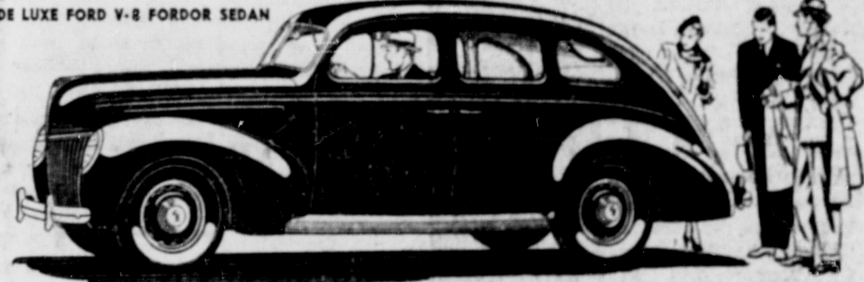
DE LUXE FORD V-8 FORDOR SEDAN

DE LUXE FORD V-8: Provides all the basic Ford features, with extra luxury and style. Remarkable amount of extra equipment included in the price. Hydraulic brakes, 85-hp. V-8 engine. Sets a new high for low-priced cars—in appearance and performance.