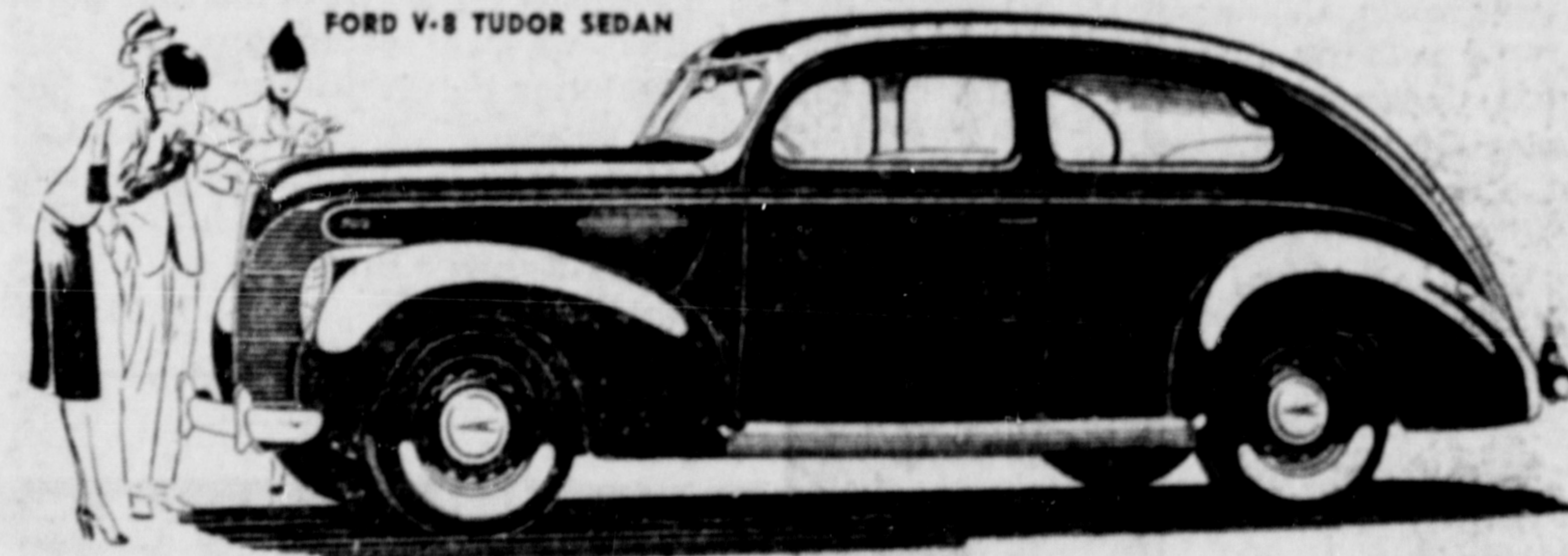
FORD V-8 TUDOR SEDAN

FORD V-8: Now five inches longer from bumper to bumper. Roomier bodies—more luggage space. New styling. Hydraulic brakes. Scientific soundproofing. Triple-cushioned comfort. 85-hp. V-8 engine.