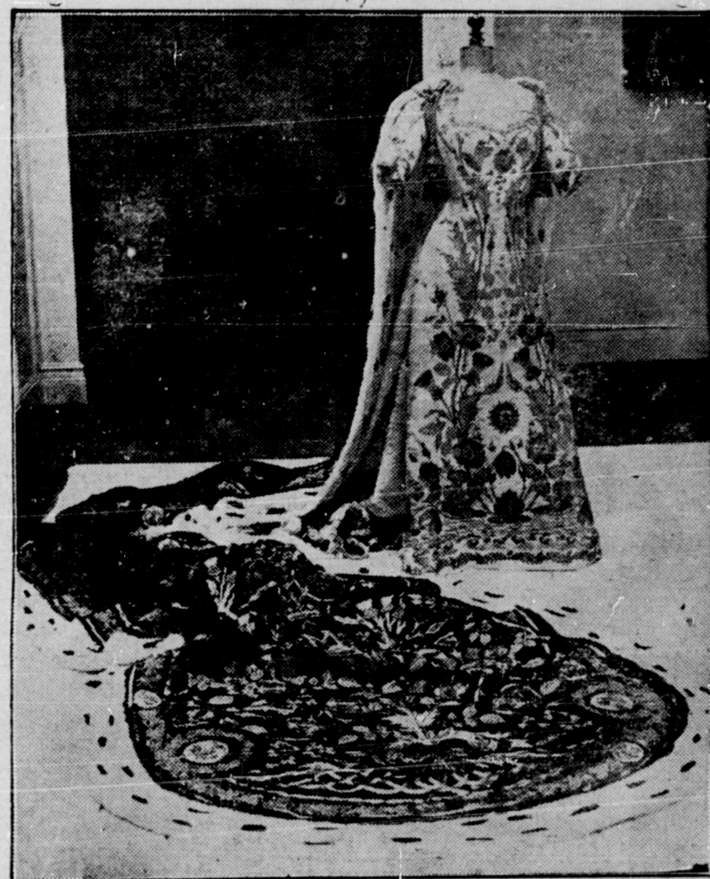
It is rumored that the ladies of Prince Rupert's Society Circle are very much alive to the necessity for being gowned in manner unimpeachable when the Governor General arrives.