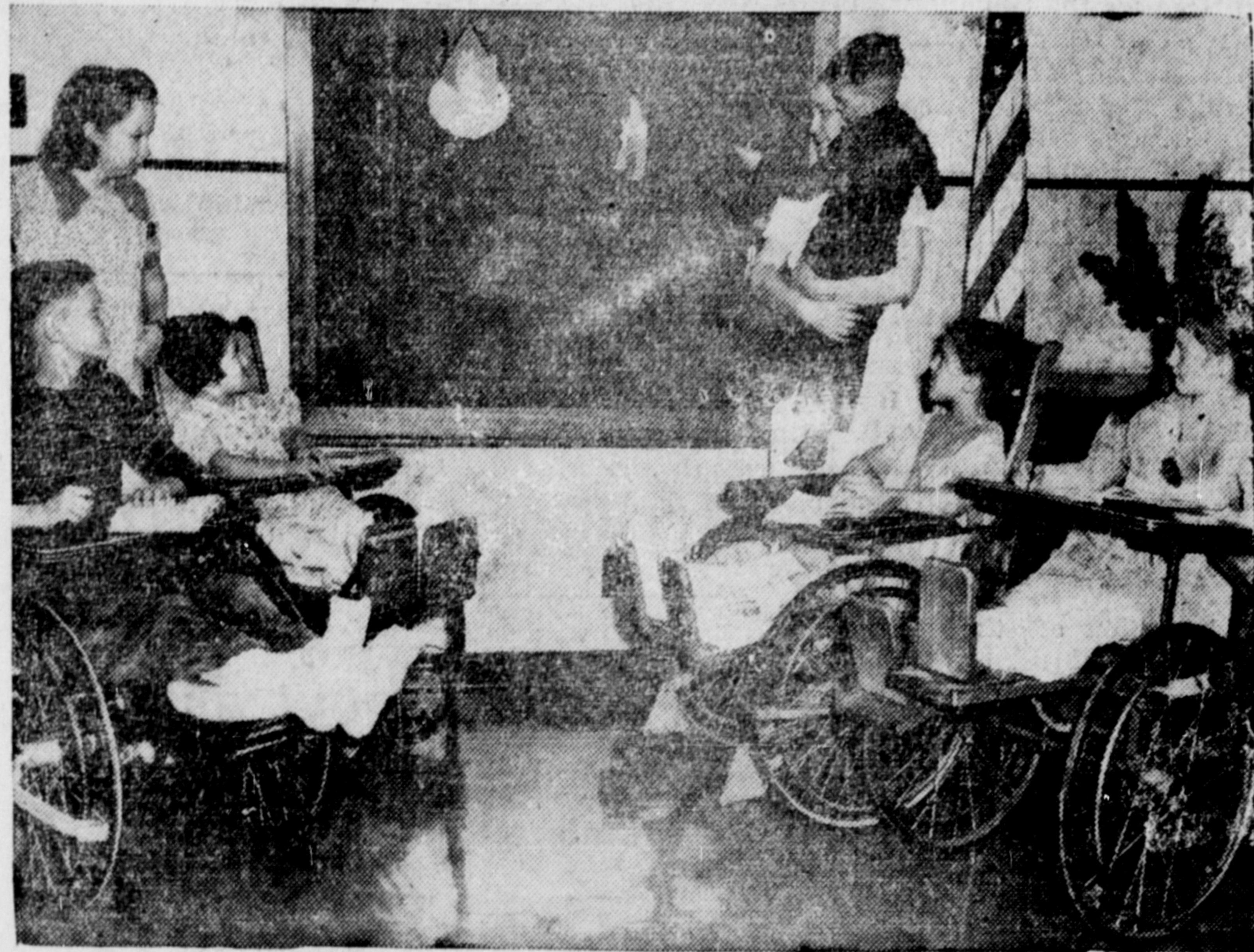
PRACTICAL HAPPINESS—Here is an illustration of the practical work of bringing happiness which the Shriners practice. The picture was taken in one of the many crippled children's hospitals.

Prince Rupert is not the only north coast town that is host to a Shrine ceremonial this year. Ketchikan will be having a similar experience in July when Nile Temple of Seattle comes north for a ceremonial and many southeastern Alaska novices will tread the burning sands in allegorical rite.