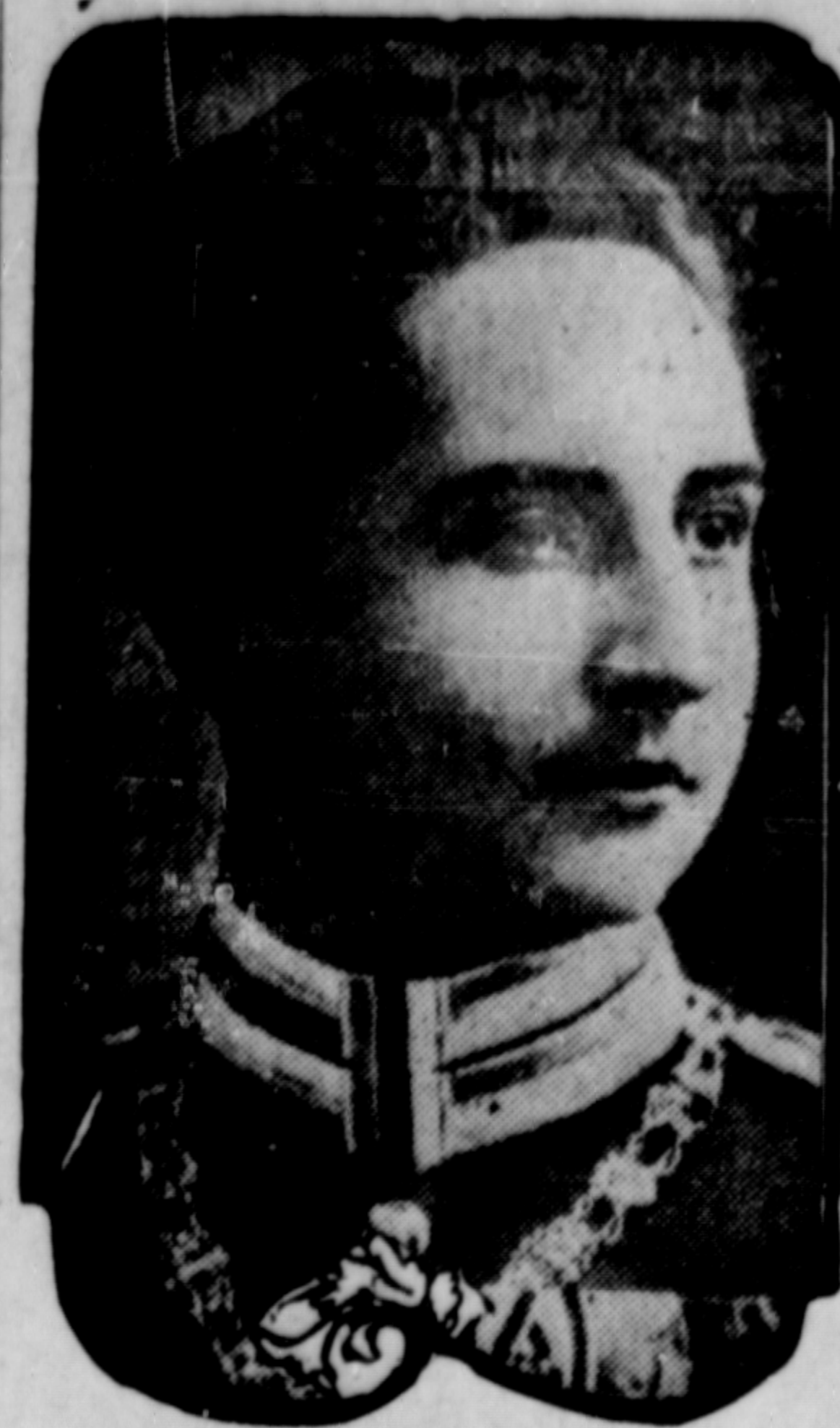
PRINCE AUGUST WILHELM

It turns out, however, that there were other things done between the Kaiser and the Tzar besides the presentation to one another of insignia and orders of high degree. Weighty affairs it seems were discussed between these representatives of great powers, and it is claimed that an attempt was actually made on the part of the Kaiser to undermine the triple entente cordiale and on the part of the Kaiser the